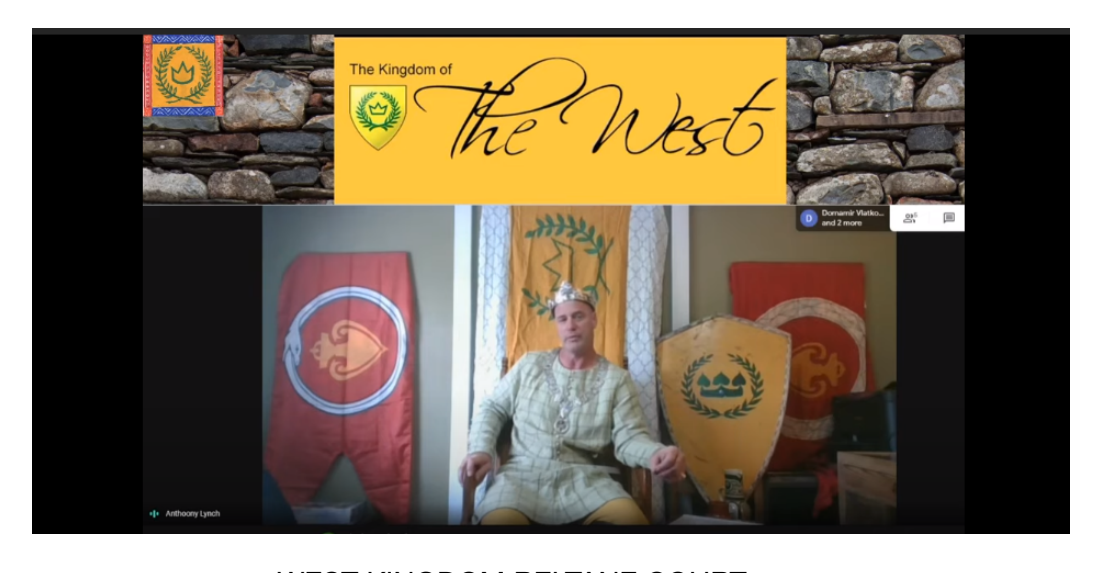
WEST KINGDOM BELTANE COURT