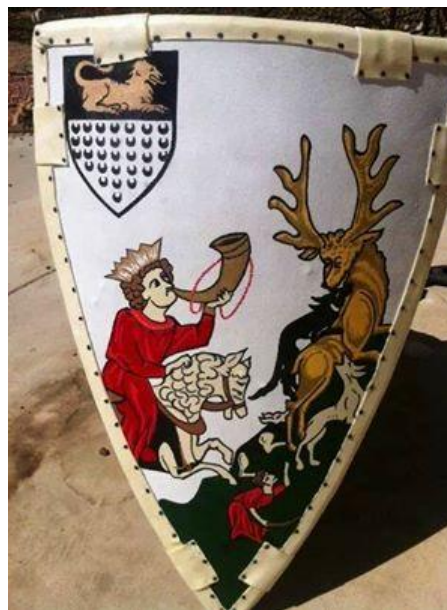
A formal Pas d'Armes shield depicting deeds of arms for a Tournament honoring The Fallen Stag in the East Kingdom. Shield and photograph by Roger Young.

Heraldic display is the easiest method of pageantry; and the one that most people are accustomed to seeing. It is the banners that are often the most visible, alongside surcoats and painted shields that truly stand out at any event. Heraldic display tells others who we are, where we reside, and what group or household we belong to, in an effective manner. Heraldic display is often seen on banners or the armor that fighters wear in tournaments, but heraldic display is not relegated only to those on the field of battle and it is usually incorporated by most members of the group.