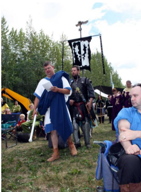
A Roman-style presentation into Opening Court during Oertha's Summer Coronet and Investiture.

Ceremony, especially in High Courts is also an easily discernible aspect of pageantry; but often considered solely the realm of the herald. While in some cases this is true; it is important to note that people can add to almost any ceremony simply by talking it over with the reigning royalty and the herald. Acts like this can be comprised of processions, speeches, or other activities that help add to the atmosphere and "magic" of any court.