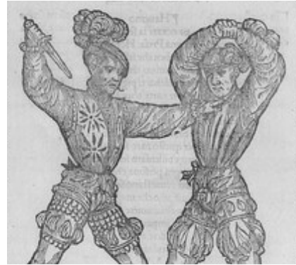
Let's get stabby!

Come join us for a weekend of fun and relaxation!