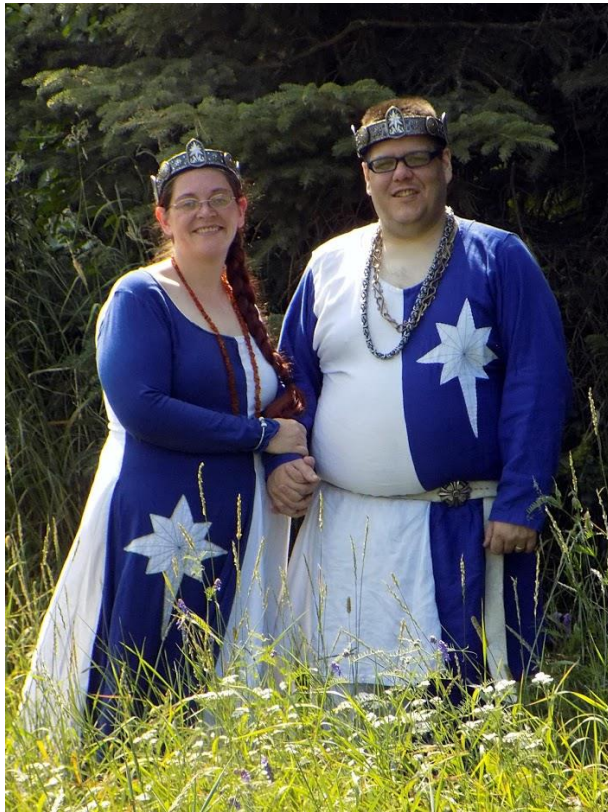
The Prince and Princess of are revealed at the conclusion of the Summer Coronet and Investiture.