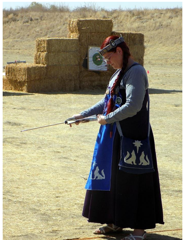
Princess Bella enters into an Archery competition at the Great Western War.