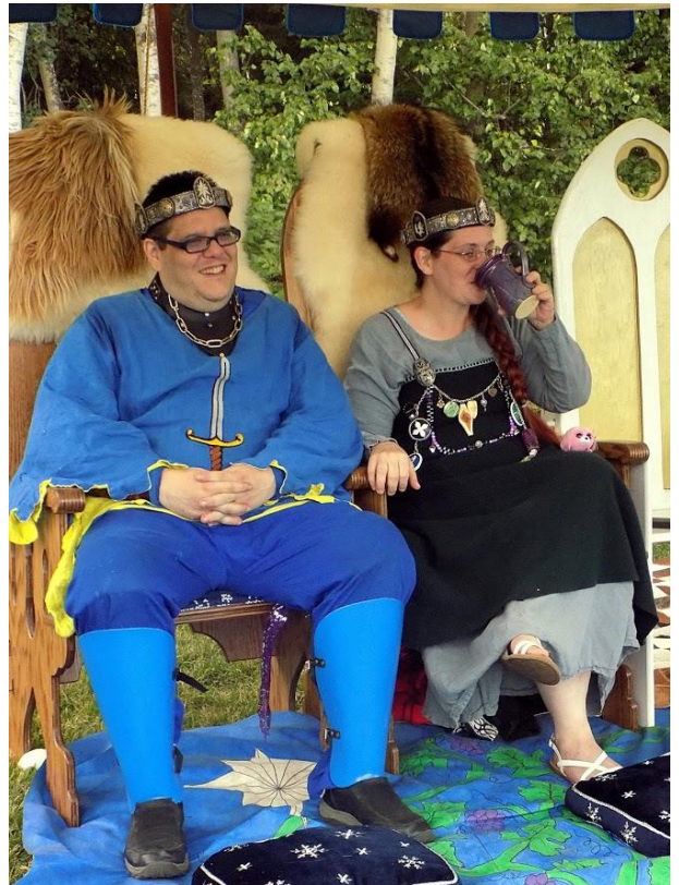
Their Highnesses enjoy the day at Eskalya's Baroness' Champion event.