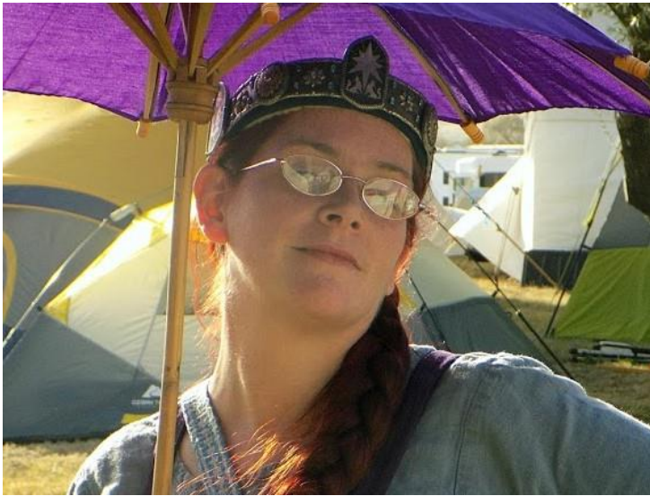
Princess Bella is ready for a shopping run at Great Western War.