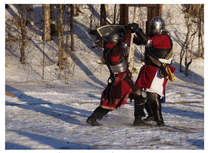
The tournament for the Coronets of Oertha begins at the Oerthan Winter Coronet and Investiture. January 18, 2020.

The tournament was well fought, with honor and chivalry proudly displayed on the field by all combatants of all stations and degrees. Sword clashed against shield, great weapons locked together, and exuberant shouts sounded over the Eric. However, as tournaments progress, there can be only one victor in the end.