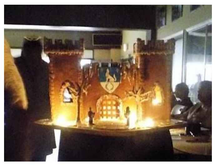
A castle good enough to eat at the Principality of Oertha's Winter Coronet and Investiture. January 18, 2020.

Feast took place directly after court. It was here that delicious dishes were presented with flair to the hungry populace with recipes gleaned from the pages of the famed A Forme of Cury . The first remove was a delightful soup with bread and cheeses. From there, the second remove was brought out and consisted of personal chicken pies and a lovely salad. After the dishes were cleared the next course was presented: roasted pork with root vegetables. Finally, for dessert, winter fruit pies were offered alongside an amazing castle subtlety much to the delight of all present.