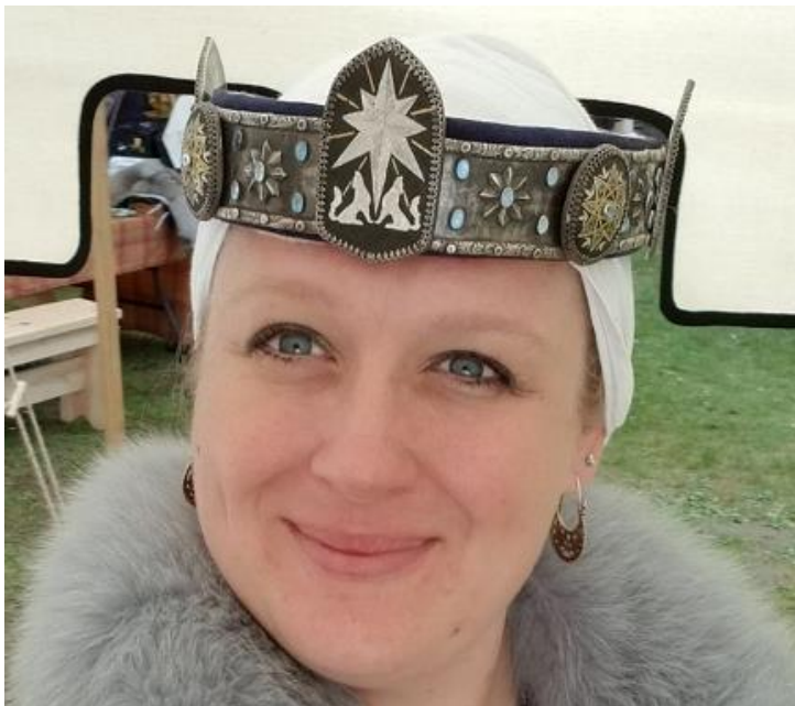
Prinzessa Violet of Oertha newly crowned at Purgatorio. Self-portraiture.