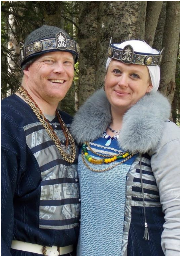
Prinz Dunaan and Prinzessa Violet, newly crowned as Prince and Princess at Purgatorio.