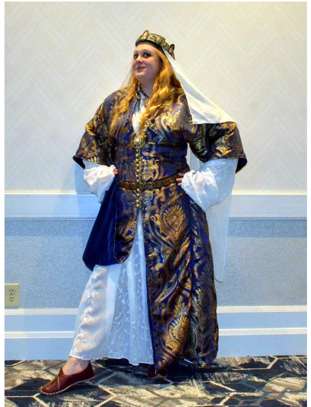
Prinzessa Violet at Twelfth Night.