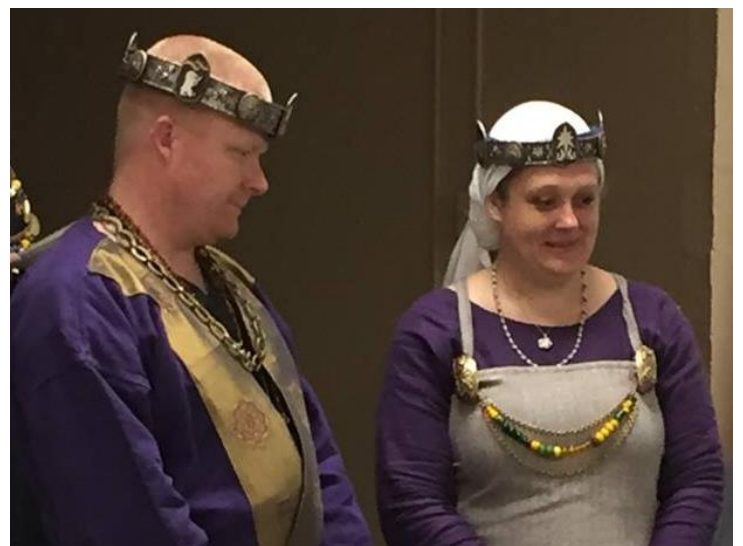
The Prinz and Prinzessa hold court at the Barony of Winter's Gate Michaelmas.

Since Purgatorio in August a lot has happened in our Principality and in the Kingdom of the West. Here are photographs of Their Highnesses from but a few of these events and activities that we participated in. Special thanks to the Oerthan History Guild and their members as well as independent photographers for preserving these wonderful memories.