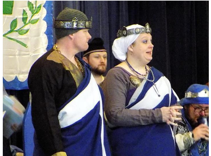
Prince Duncan and Princess Violet of Oertha address the populace. January 21, 2018.

Highnesses assured the populace, they would always be Oerthans at heart.