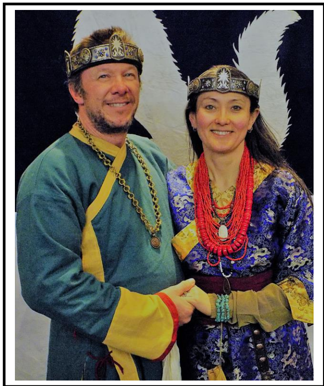
Here recognize Skeggi and Kharkhan, the 67th Prince and Princess of Oertha!