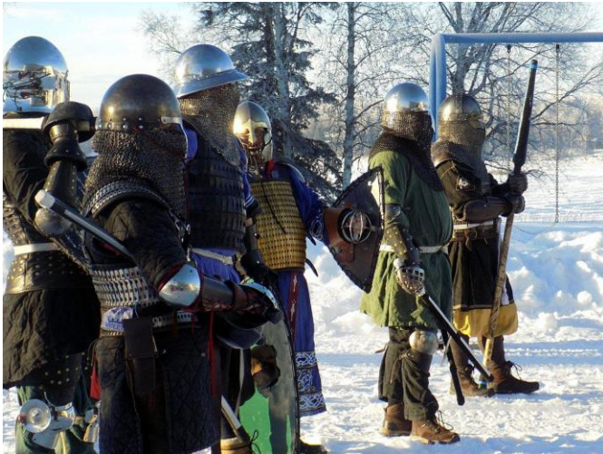
Combatants prepare to enter the Coronet List.

The tournament was about to begin and had seven combatants in total. While the weather was chilly and there was ample amount of snow; there were plenty of people bundled up warmly and outside along the side of the list field to witness the tournament. For those not inclined to spend the time outside; the hall had large windows overlooking the tournament field so that they could still enjoy the tournament.