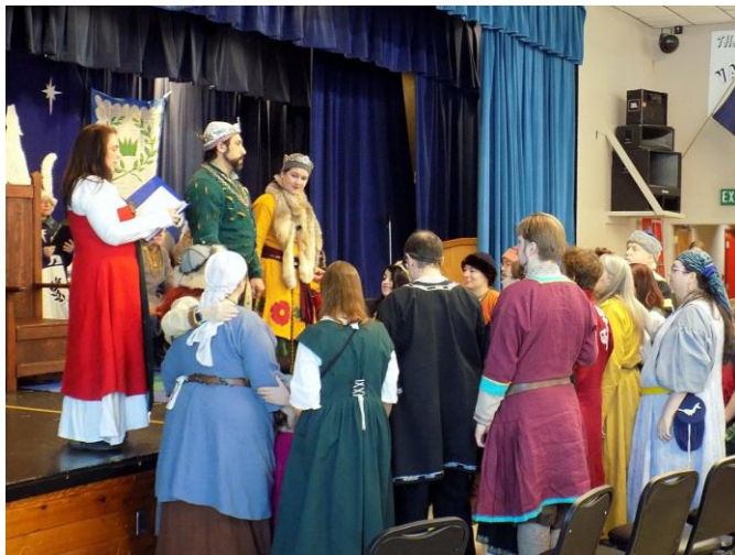
Members of the Principality of Oertha pay homage to the King and Queen of the West. January 20, 2018.

A brief court opened the event and it was here that Their Majesties accepted Fealty from those who wished to do so—including populace members who were invited to give homage to the King and Queen of the West in which many took the opportunity.