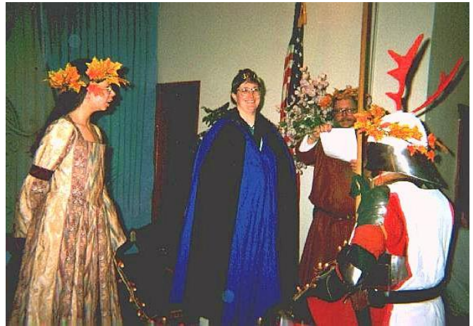
Image 4. Reproduction of the White Stag's Presentation.

The ladies within the encampment, noticing the commotion, quickly gathered and ran towards the White Stag. The hunters, knowing nothing of the agreement between the ladies and the White Stag, thought that the gentler sex had come to witness the taking down of such a mighty beast. Much to the hunter's surprise, the ladies had come to protect the White Stag and the beast, in which the hunters graciously gave way and so the White Stag made his procession into the encampment surrounded by the women.