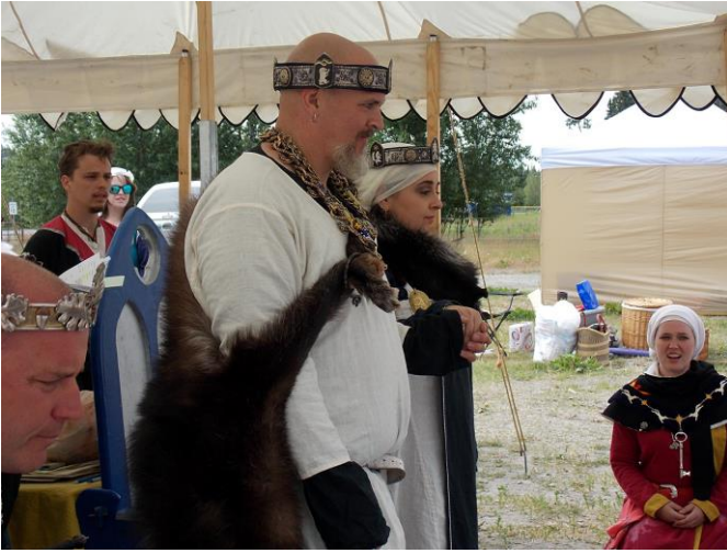
The new Prince and Princess of Oertha. July 22, 2018.