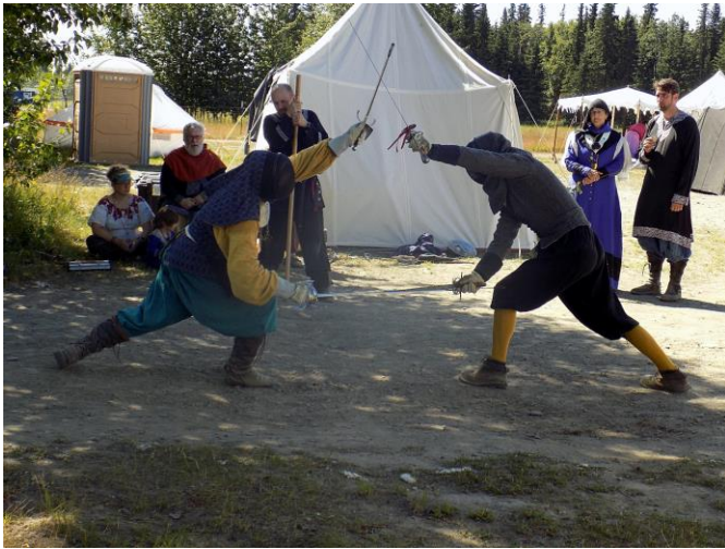
The Rapier Community takes part in the Roses Tournament at the Oerthan Summer Coronet and Investiture. July 21, 2018.

person who lost the fight at the direction of the winner, were sent to many in the encampment alongside the kindest of words.