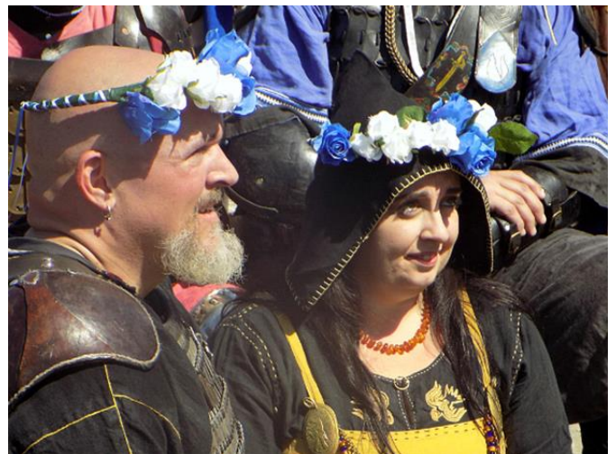
The Lord and Lady Borealis are proclaimed at the Oerthan Summer Coronet and Investiture. July 21, 2018.