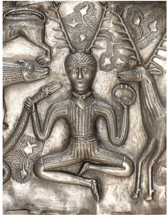
Image 2. Image of Cernunnos.

Baden-Powell's farewell speech to the Scouts