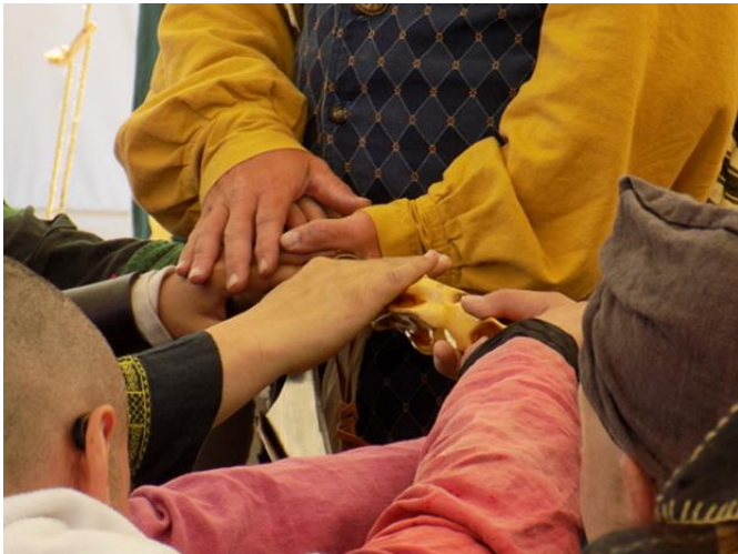
Entrants to the Coronet Lists swear of the Axe of State at the Principality of Oertha's Summer Coronet and Investiture. July 21, 2018.

With awards and recognition bestowed upon members of the populace it was time to start the ceremony to begin the Coronet Tournament. Seven fighters were called forward to take part in the Invocation. After presenting themselves and their Consorts to the populace and the Prince and Princess of Oertha; the fighters concluded the ceremony by taking the oath and choosing their opponents for the first round of the tournament.