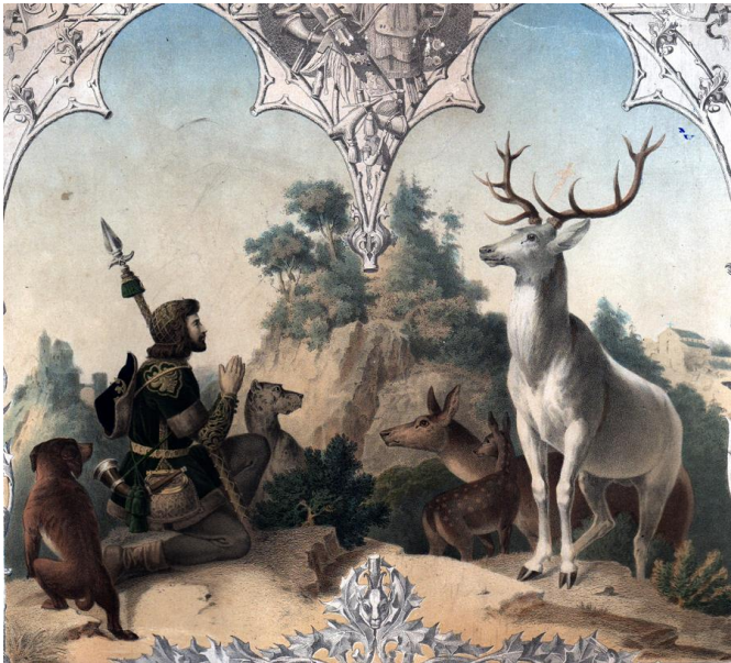
Image 1. Depiction of a Knight and the White Stag.

The White Stag is an important historical-religious figure found in European and Eastern European mythology. In Celtic tradition, the White Stag is considered a messenger from the Otherworld and often thought to appear when one was transgressing a taboo. In Arthurian legends the White Stag was thought to represent mankind's spiritual quests and that it perennially evaded capture. In English folklore, the White Stag is associated with Heme the Hunter and even kings. In Christian tradition, the white stag is, in part, responsible for the conversion of several saints, including Saints Eustace and Hubert and often a representation of Christ. In Hungarian myth it was the White Stag that led the brothers Hunor and Magor into Scythia to found two great Empires—the Huns and the Magyar.