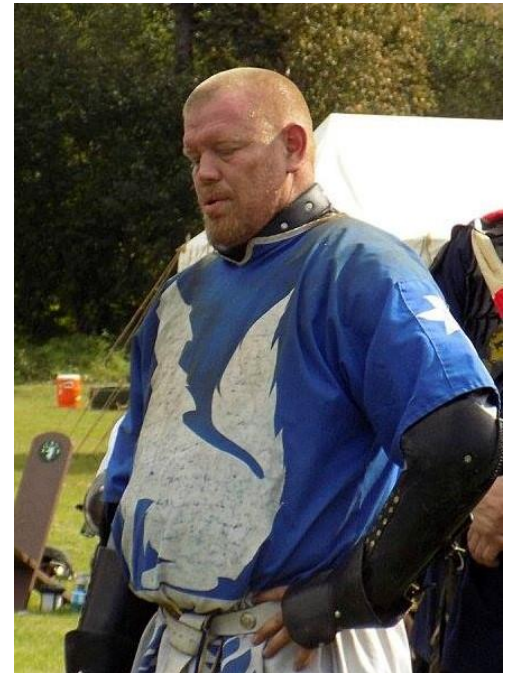
Prince Kenric takes a short break from the fighting held at the War of the Chicken in the lands of the Barony of Selviargard.