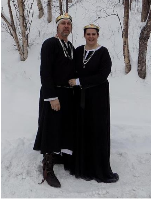
Prince Søren and Princess Alienor upon their accension to the Lupine Thrones. January 22, 2017.