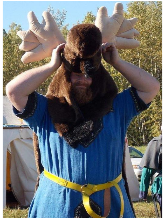
A moose sighting during Fall Captaincy in Winter's Gate. September 3, 2016.