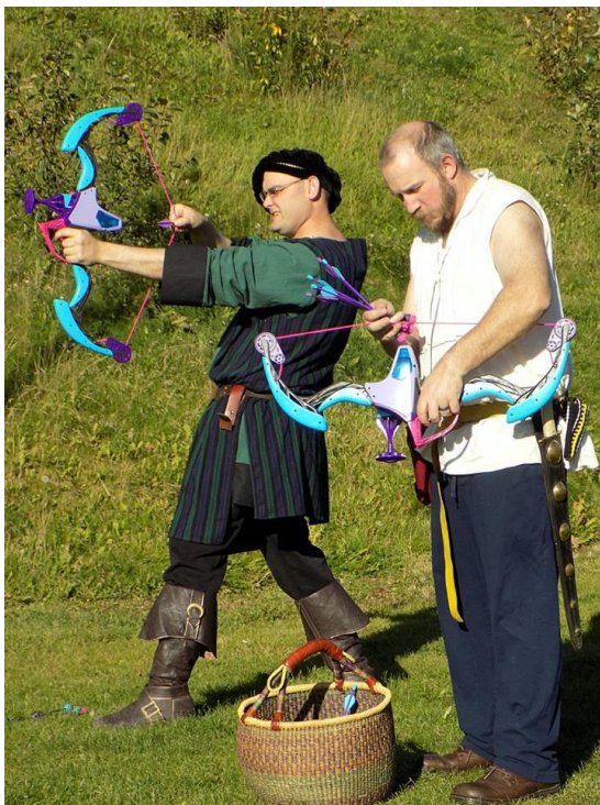
Archery was held at Eskalya's Baroness' Champion event. September 10, 2016.