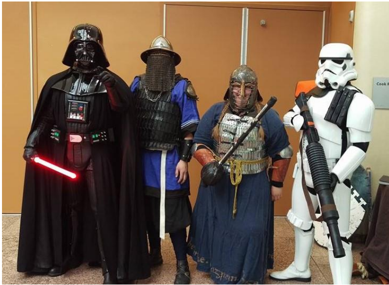
The SCA takes part in SenshiCon. October 2, 2016.