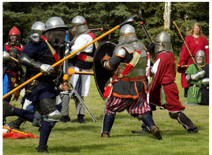
Egg-cellent battles fought at Chicken Wars V. August 20, 2016

Since Summer Coronet in July a lot has happened in our Principality. Here are photographs from but a few of these events and activities that we participated in. Special thanks to the Oerthan History Guild and their members as well as independent photographers for preserving these fascinating memories.